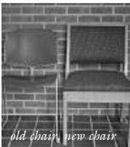
old chair, new chair