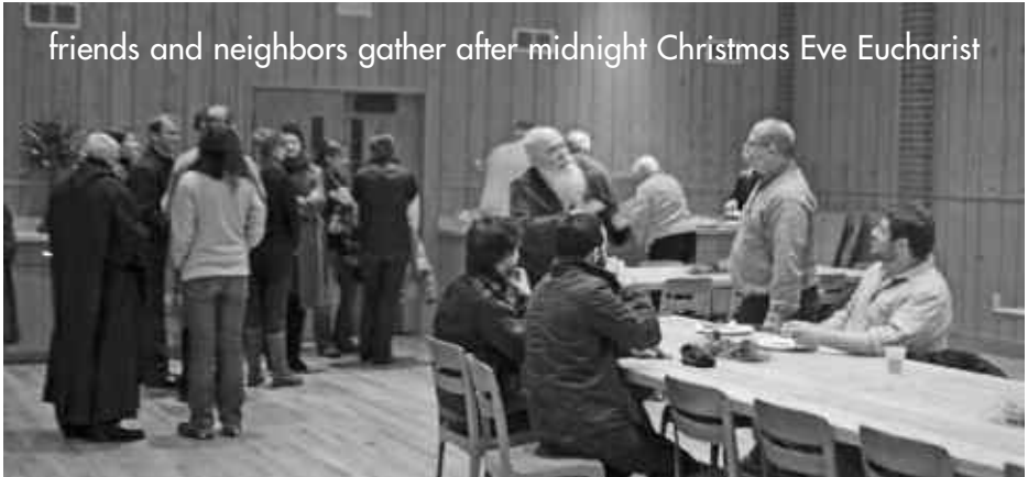
friends and neighbors gather after midnight Christmas Eve Eucharist

Donations are welcome and can be made at the website or sent to St. Gregory's Abbey designated for "music compositions". Hard copies of scores and orchestral parts are for sale at list price from webbermusic.com